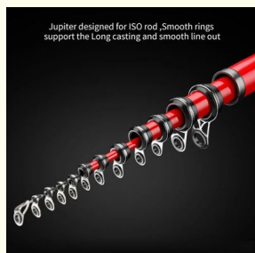
Jupiter designed for ISO rod, Smooth rings support the Long casting and smooth line out